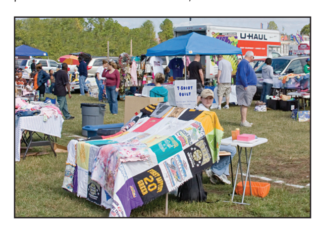
Additional Information DFMWR GORDON.ARMYMWR.COM

If space is available, applications will be accepted in person until noon on October 12, 2023.