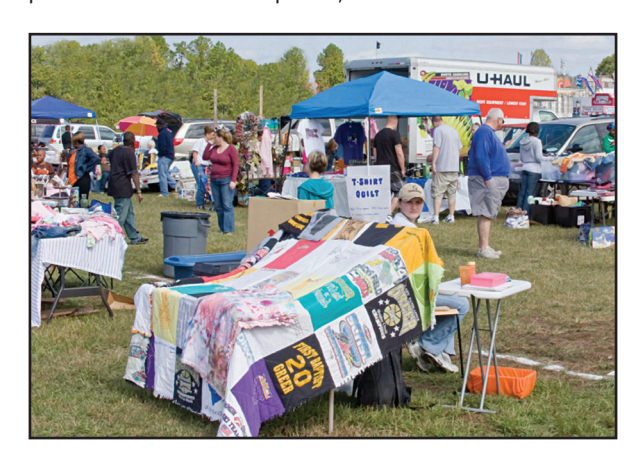
Additional Information DFMWR EISENHOWER.ARMYMWR.COM

If space is available, applications will be accepted in person until noon on April 18, 2024.